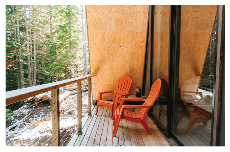
A peek at the covered terrace, which spans the bedroom's rear wall and overlooks a quiet corner of the lot.

A wood-burning fireplace creates a cozy aesthetic in the bright and open living room, which is lined with fir plywood and engineered hardwoods. Fitted with brand-new stainless-steel appliances, the kitchen also has plenty of storage thanks to open shelving and custom birch cabinets. In total, the home has two bedrooms, two bathrooms, an open loft area, and a finished basement with a utility room—a rare find in A-frame cabins. One of several homes located within The Pass Life Community.