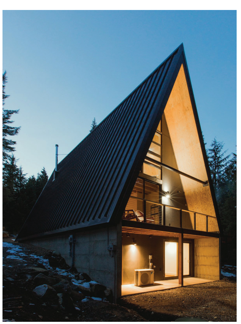
A look at the back of the A-frame, which includes an entrance to the basement level. Here, you can see the detailing of the seamed metal roof, as well as the concrete foundation.