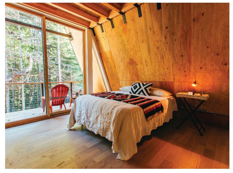
Exposed wood finishes continue into the bedrooms. Large, sliding doors frame picturesque views of the forest waiting outside.