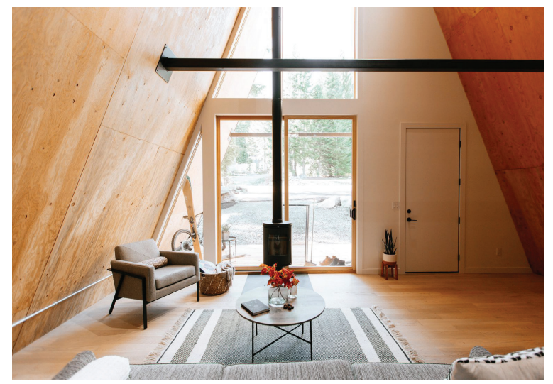
Centered around a wood-burning fireplace, the main living area feels open and airy, as it stretches to the top of the steeply pitched roof.

On the exterior, a standing-seam metal roof protects the property from extreme weather while blending it into the