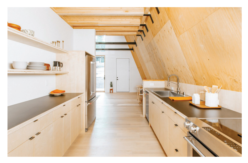
The large galley kitchen lies steps away from the living room. Pale Birch cabinets on both sides of the room provide plenty of storage and counter space.

surrounding forest. Spacious cedar verandas on both the front and back offer covered areas to savor the serene, woodsy setting. "The dramatic proportions and scale from the outside are complemented by the cathedral-yet-cozy experience on the inside," Rylant continues.