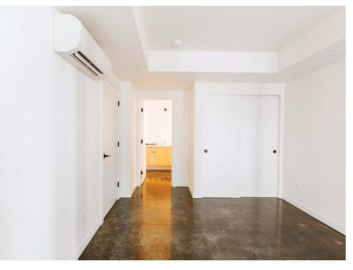
The basement includes a spacious utility room — the perfect spot for storing excursion gear.