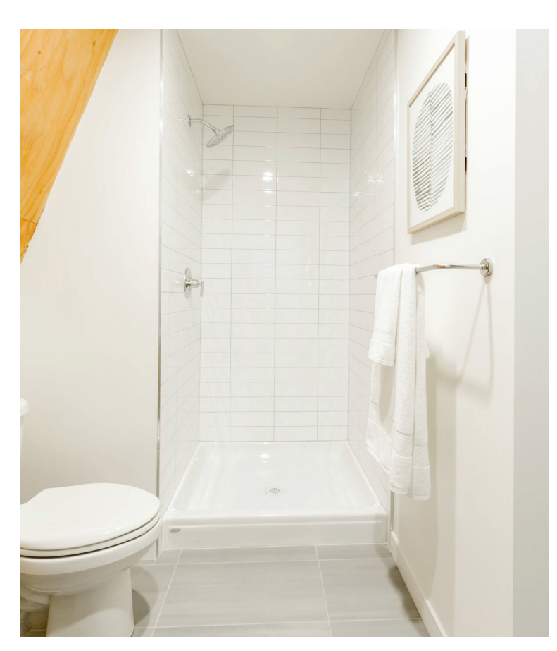
Subway tiles line the standing shower in the crisp, white bathroom.